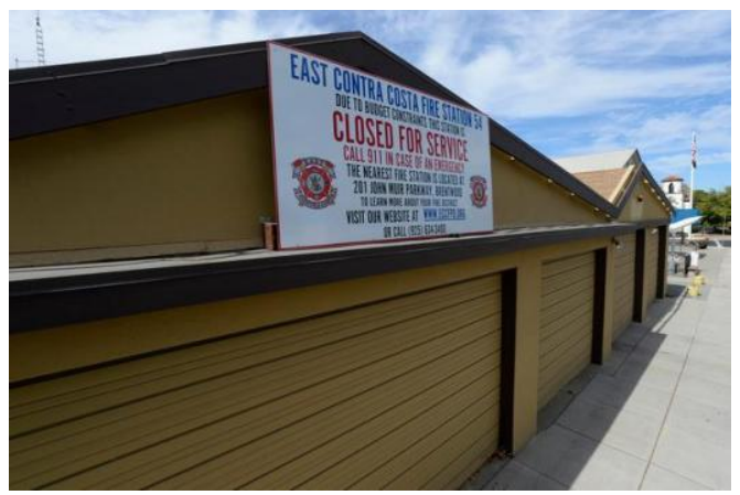
A sign notifies people that the East Contra Costa Fire Station 54 has been closed for service in Brentwood on Sept. 28, 2015.