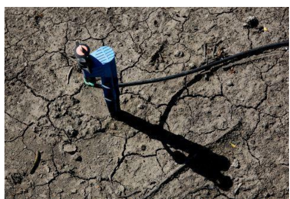
A low-flow water emitter sits on some of the dry, cracked ground of an almond orchard in the Sacramento-San Joaquin Delta near Stockton in 2015. As the state entered a fourth year of drought, huge amounts of water were mysteriously vanishing from the Sacramento-San Joaquin Delta, and farmers whose families for generations have tilled fertile soil there were the prime suspects.

1) Groundwater: After 100 years of allowing cities and farms to pump as much water as they wanted from the ground, without reporting it to the state or being limited, dozens of communities across California found themselves with precariously dropping water tables as the drought began. A study using NASA satellites in February found the ground in some areas between Merced and Bakersfield dropped as much as two feet as underground aquifers collapsed during the drought, cracking roads, water canals and pipelines.