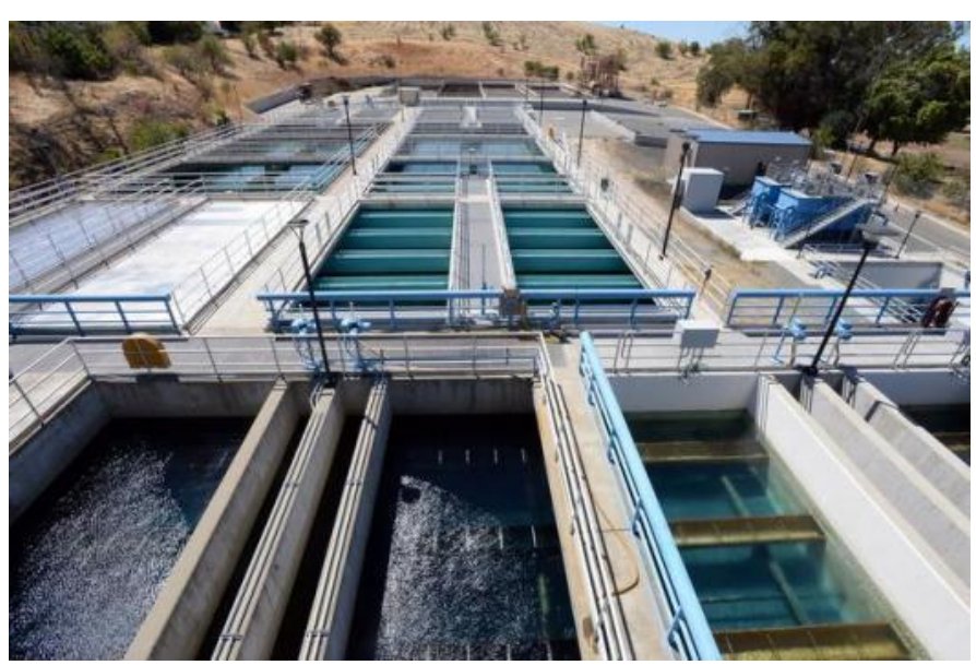
The city of Antioch is demanding that the state grant equal rights to fresh water after a 2016 sweetheart deal gave Contra Costa Water District a fresh water pipeline in exchange for its silence on the State Water Project.