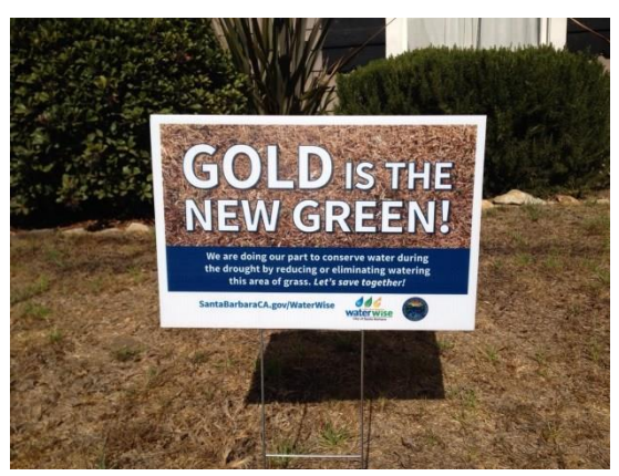
Homeowners across the state saved billions of gallons of water by removing lawns.

4) Lawn removal and conservation: Urban Californians cut water use 22.5 percent between June 2015 and February 2017. Over that time, 2.6 million acre-feet of water was saved — enough to supply more than 13 million people for a year. Water agencies spent hundreds of millions of dollars during the drought giving rebates to people to install low-flush toilets, efficient washing machines, gray water systems and dishwashers. The Metropolitan Water District in Southern California spent $310 million alone in rebates for people to remove 160 million square feet of grass, which will save 21,000 acre feet of water every year.