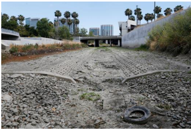
Looking south, one can see the dried up Guadalupe River near Santa Clara Street in San Jose, Calif., on Friday, July 17, 2015.